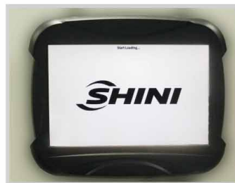
Main controller 10"