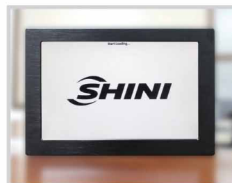
Main controller 12"