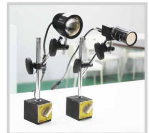
Camera and light source