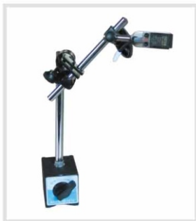
Middle Mold Detector