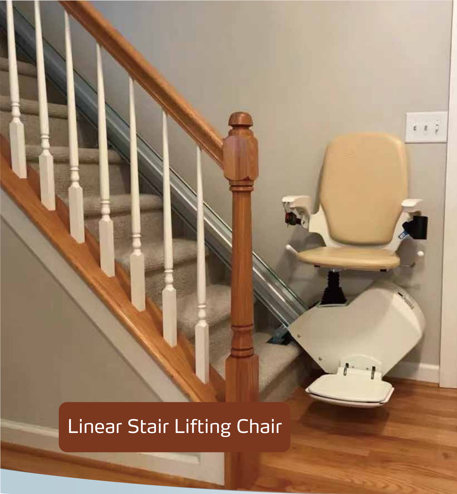
Linear Stair Lifting Chair