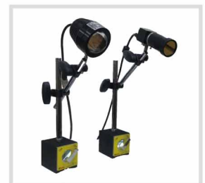
Camera and light source