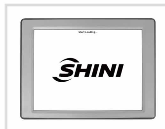
Main controller 12"