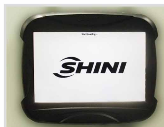
Main controller 10"