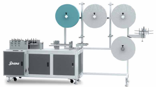
3-ply face mask tablet machine

Whole set of the equipment is suggested: SMKS-A*1+SABW*4+SCI-300W-2000L(option)*1 (adjustable H=700~1000mm).