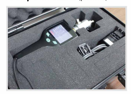
Models with optional portable dew-point monitor is convenient to test dew-point temperature of different machines.